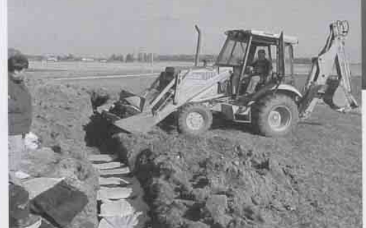
Published in Scrap Tire News, Vol.17, No. 2, February 2003